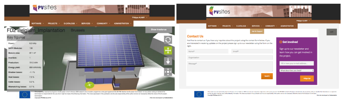
Figure 2- Projects publication on line - Ask for support form

In addition, PVSITES BIM objects have been designed and embedded within the simulation software. A pre-commercial version of PVSITES eCatalog is open to public use as a BIPV Product Information Manager (PIM) through web access. The PIM aims at configuring virtual BIM objects considering the real technical characteristics (geometrical, electrical, thermal, optical) to be used as input to the simulation and calculation models.