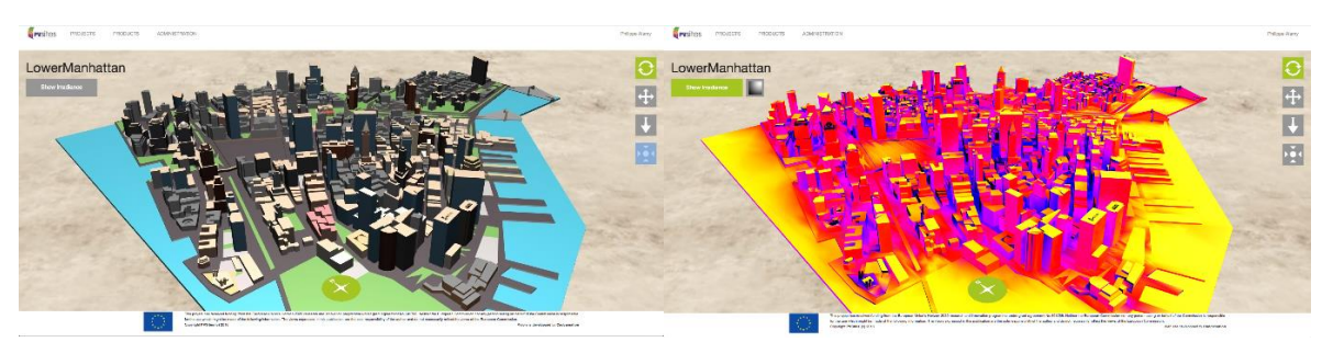
Figure 1- 3D online viewer – Irradiance display

Real time 3D viewer: to optimize the design workflow, the PVSITES solution allows instant import of 3D models combined with intuitive and real-time results display, the online viewer enables the user to navigate into the scene with equal performance and functionalities than in the standalone simulator. Further than navigation, the tool provides results through 3D graphical user interfaces, diagrams, and histograms.